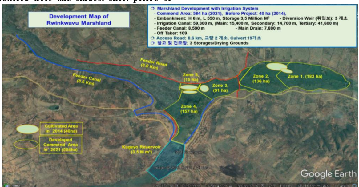
Figure.1. (Rwinkwavu) Satellite map of marshland development

rain and long dry seasons and often large herds of grazing animals on the savanna that thrive on the presence of grass and trees. The project beneficiaries in Rwinkwavu site are made up of 3,152 households (1,605 males and 1,547 females). All beneficiaries belong to one cooperative and one Water Users Association (WUA). A total area in lower marshland developed by RCSP is on 462ha.