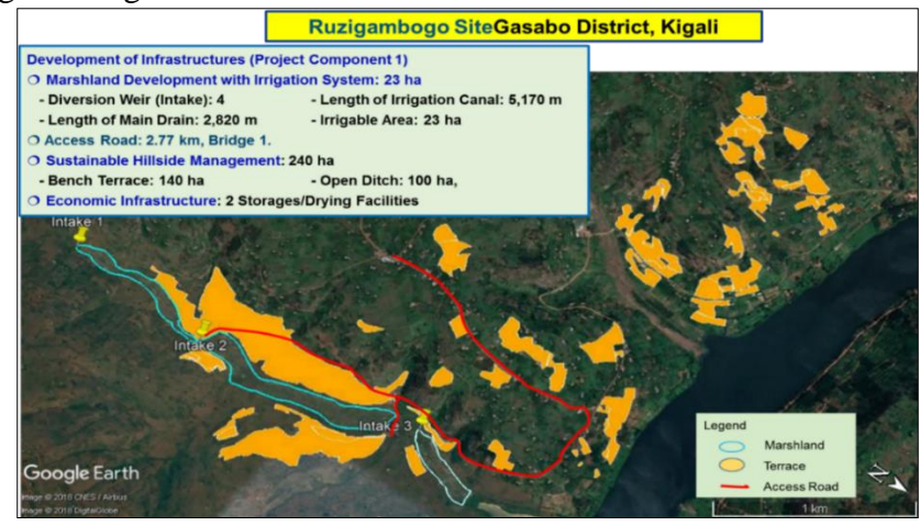
Figure.3. (Ruzigambogo): Map of marshland and hillside (terrace farm) development area

increase agricultural production, increase beneficiary farmers' income, reduce poverty and improving living conditions. The site is located in GASABO District; at about 1 hour drive from Kigali. The Project site covers the sectors of GIKOMERO and Fumbwe of RWAMAGANA District. The site benefited 499 farmers' households (355 males and 144 females), organized into 24 Self Help Groups (SHGs) spread across 8 zones.