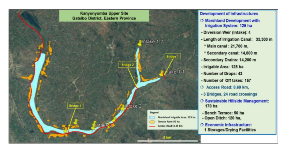
Figure.2. (Kanyonyomba) Satellite map of marshland and hillside development area